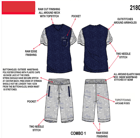
Fig. 2: Design & Technical Specifications of a boy's clothing set