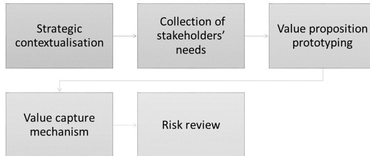
Fig. 1. Overall view of the prototyping approach.

framework results from the study of PSS design literature, agile approaches for smart PSS, Value proposition design methods [1] [9], and Risk management [10]. Thus, the approach described below follows an iterative logic inspired by [5]. This logic facilitates to react to the different types of risks during the whole engineering process.