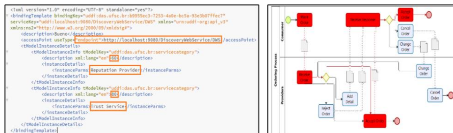
Fig. 3. (a) Example tModel (b) UBL Ordering Process BP

VBE's partners information (see section 4.1) have been previously stored in its database (implemented using the SQL Express tool). Services repositories were implemented using the UDDI , from W3C, using JUDDI tool. Services' information is registered in the tModel UDDI's structure in XML , being partially fed by the respective provider and partially fed by the Federation or VBE. Figure 3a presents an excerpt of the tModel of a given service, showing the service's reference (for its future invocation) and the meta data and respective values e.g. for its reputation and trust .