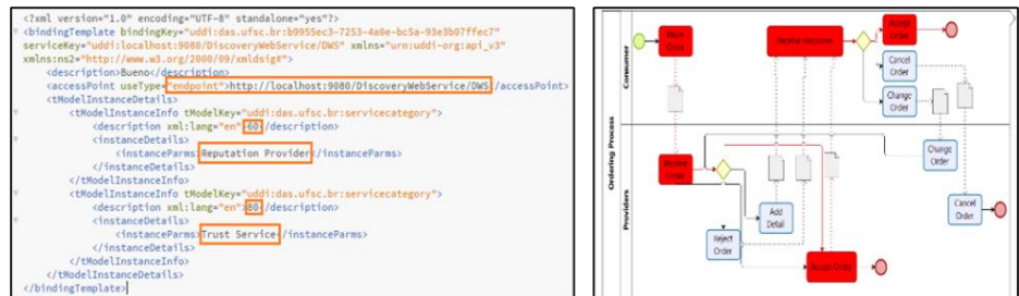
Fig. 3. (a) Example tModel (b) UBL Ordering Process BP

VBE’s partners information (see section 4.1) have been previously stored in its database (implemented using the SQL Express tool). Services repositories were implemented using the UDDI , from W3C, using JUDDI tool. Services’ information is registered in the tModel UDDI’s structure in XML , being partially fed by the respective provider and partially fed by the Federation or VBE. Figure 3a presents an excerpt of the tModel of a given service, showing the service’s reference (for its future invocation) and the meta data and respective values e.g. for its reputation and trust .