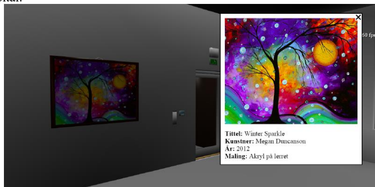
Fig. 2. Interaction with a painting, in a 3D visualisation of a BIM model [26]

The main aim of the implementation was for users; e.g. facility managers or patients, to walk around in the virtual building and interact with the building and various objects within the building. St. Olav owns a large collection of art. Thus, the prototype chose presentation of the artwork and paintings in the virtual hospital building, where the user could identify their locations and interact with the paintings to learn about them and update information about them as relevant; see Fig. 2. Users could also select a room in the building and access presentations and videos that have been presented in the room. Such a functionality is aimed at enhancing implicit collaboration, communication and knowledge sharing among different stakeholders of the hospital.