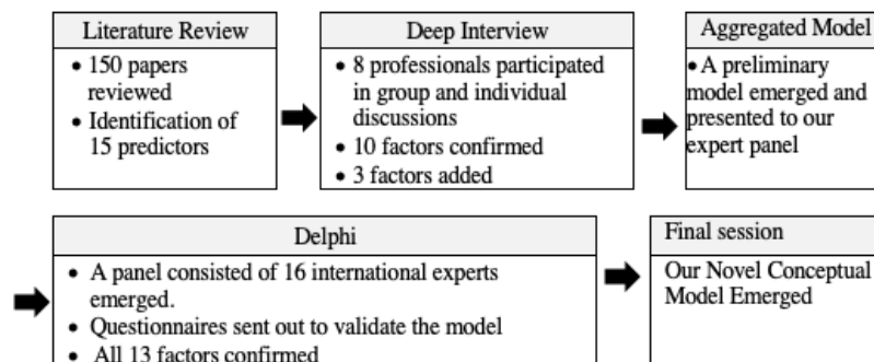
Fig. 2. Methodology process and procedures

with the ecosystem actively to obtain a better understanding of the situation. 13 factors