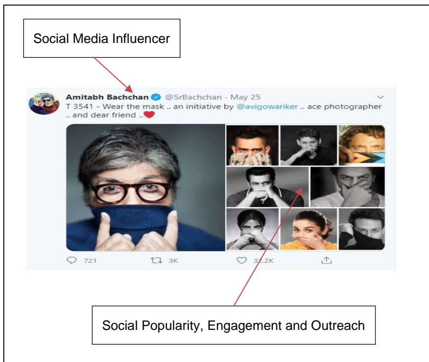
Figure 2. Sample Stimulus in Baseline Format

Each session will involve 30 chosen stimuli, which are likely to trigger changes in the level of trust and emotions about the information disseminated by the tweet. The stimuli will be grouped into two sets: Set A and Set B. The stimuli from set A will be manipulated to include tweets from Social media influencers, in baseline format. Figure 2 shows a sample stimulus in baseline format. In this format, we shall include details of the tweet along with information about the number of people who liked the tweet, number of views, and the number of retweets garnered by the tweet. Set B will include stimuli in an enhanced format. As shown in Figure 3, the enhanced format will include additional information about other social media influencers who like the tweet.