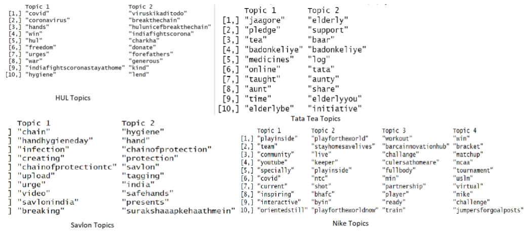
Fig. 3. Topic models for the data

The campaign run by HUL and UNICEF, #Breakthechain is also used by Kerala's state government and also randomly by people to address the breaking of covid-19's chain in their tweets. Thus, most of the tweets with this hashtag, are not relevant to the specific brand campaign. Savlon's competitor brand Dettol was one of the most used words of the campaign. No other competitor's name was seen in keywords which suggests that the Dettol and Savlon are often viewed as similar brands by consumers. Tweet key words were related to Tata's brand, its product like Tata tea, tata tea gold etc., which means that the users value its brand and connect to it. Some key words were also related to the target audience like "age", "elderly", "senior" etc, which means it was clear among the users that the campaign is targeted at senior citizens.