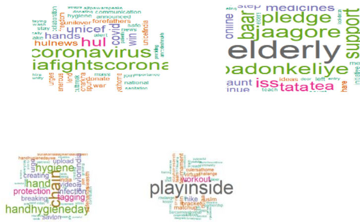
Figure 2 Word cloud of campaigns