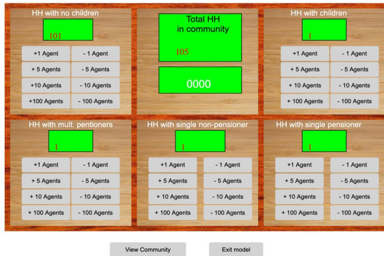
Fig. 1. Community configuration interface (GUI)

In order to be able to create different communities with diverse composition (varying number of each category of households) and also model different scenarios in the communities, the model is designed to provide dynamic community creation capabilities. For instance, in one instance, one could create a community with a tentative configuration of 20- Single pensioner household, 140- Single non-pensioner household, 10- Multiple pensioner household etc. In another instance, one could create another community with a tentative configuration of 5- Single pensioner household, 300- Single non-pensioner household, 150- Multiple pensioner household etc. These configurations can be done on the fly while the model runs. The Graphical User Interface (GUI) designed to achieve these configurations is shown in Figure 1.