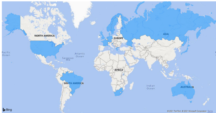
Fig. 1. Countries Represented by WISE Authors

During the 14 years in which WISE has been held, a total of 231 papers have been presented by authors from the 15 countries shown in the map below (Figure 1), including the USA, UK, South Africa, Russia, Sweden, and Norway. The contribution from each country is shown in Figure 2.