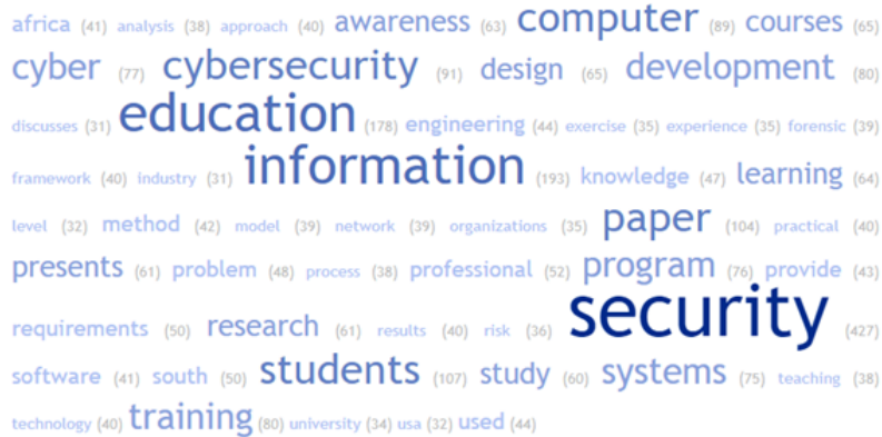
Fig. 3. Top Terms in Published WISE Papers

A total of 114 papers are currently available in the various proceedings published by Springer. A content analysis based on the title, abstract, and keywords of these papers provide some insight into WISE topic areas. The top terms are shown in the word cloud in Figure 3. The top five terms are: Security, Information, Education, Cybersecurity, and Computer.