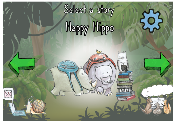
Fig. 1. Main menu of the game