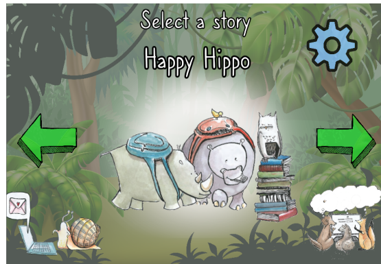
Fig. 1. Main menu of the game