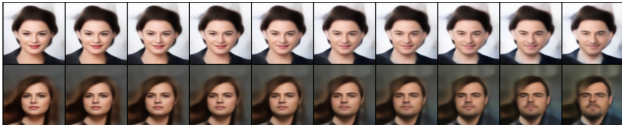
Figure 2. Selected samples of the reverse male to female generation process. NB : These samples are generated using equation (3) as transport flow was solely trained to map male to females.

As shown on Figure 1, decoding the transported samples along the transformation trajectory shows that the flow f_\theta progressively transforms the male samples to females. As expected, the conservative nature of the model promotes transformations that retain non gender-specific features, as we observe that attributes such as pose, skin tone, face shape and background are preserved during the transformation. Figure 2 demonstrates an additional interest of the Hamiltonian architecture as we are able to generate males from female samples by simply integrating the flow backward (see Eq. 3). One should note that these results were obtained without ever training the model to map females to males as we do not compute the cyclic loss used in CycleGAN. These results are similar to the results of de Bézenac et al. (2021) while no penalization of the magnitude of the flow applied by the model is used but invertibility is enforced instead.