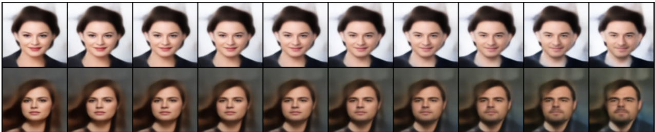
Figure 2. Selected samples of the reverse male to female generation process. NB : These samples are generated using equation (3) as transport flow was solely trained to map male to females.

As shown on Figure 1, decoding the transported samples along the transformation trajectory shows that the flow f_\theta progressively transforms the male samples to females. As expected, the conservative nature of the model promotes transformations that retain non gender-specific features, as we observe that attributes such as pose, skin tone, face shape and background are preserved during the transformation. Figure 2 demonstrates an additional interest of the Hamiltonian architecture as we are able to generate males from female samples by simply integrating the flow backward (see Eq. 3). One should note that these results were obtained without ever training the model to map females to males as we do not compute the cyclic loss used in CycleGAN. These results are similar to the results of de Bézenac et al. (2021) while no penalization of the magnitude of the flow applied by the model is used but invertibility is enforced instead.