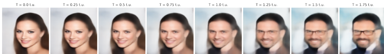
Figure 3. Results of excessive integration of the transport flow. A model trained to map males to females in 1 t.u. is integrated backward for more than twice the map horizon. We observe that the generated samples retain semantic sense for up to about 1.5 times the training horizon.