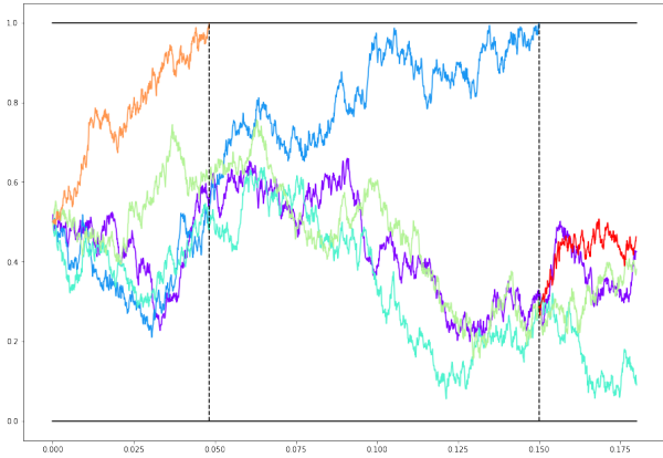
(a) Resampling. Just before time 0.05, the orange particle is killed but no resampling occurs. Around time 0.15, the blue particle is killed and the green particle is resampled to produce the red particle.

After time \tau_1 the system evolves as independent copies of X until the next killing/branching event, denoted by \tau_2 , and at time \tau_2 it may undergo a resampling/selection event as above. By iteration, we define the sequence \tau_0 := 0 < \tau_1 < \tau_2 < \dots < \tau_n < \dots .