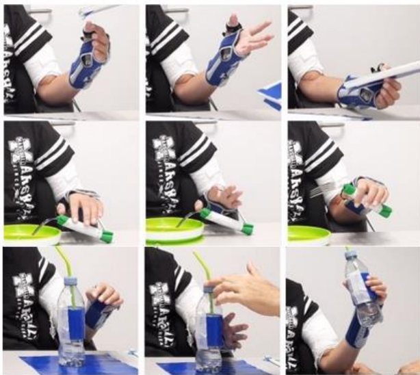
Figure 2: Example of 3 tasks achieved by participant 1. Top: key grip pinch. Middle and Bottom: palmar grasp.

Tests confirmed the ability to produce multiple movements including functional and reproducible key-grip and digito-palmar grasping. In participant 1, voluntary muscle contraction detection and voluntary movement detection control interface modalities were successful. For participant 2, only the voluntary movement detection modality was possible due to an important fatigability of the shoulder muscles. The success rate in task execution was estimated using Motor Capacity Scale C score at 54% for patient 1 and 51% for patient 2. The results will be detailed during the presentation at the conference.