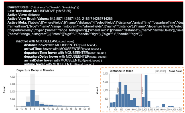
Figure 2: A snapshot of the dashboard obtained applying the Interaction-Driven Framework to a crossfilter interface. The user is currently brushing on the “Distance in Miles” histogram.

(ii) A user interaction is captured by the interaction layer and sent to the translation layer which extracts the SQL queries to be executed. This feature is implemented through the Label Module (LM) , which gives the result back by labeling the statechart. The generations of SQL prepared statement is implemented by the Query Module (QM) which manages a Query Storage (QS) , i.e. a data structure containing SQL Fragments. When the statechart is initialized, LM assigns a specific set of query parameters to each of its transitions that contribute to the SQL Statements. Those parameters are referred to as Query Metadata , organized in a set of query labels . When a transition leads to a state containing a Query Metadata, that information is acquired by QM : for each Query Label, a SQL Prepared Statement is created by taking from QS all the different fragments and filled with dimensional values and parameters.