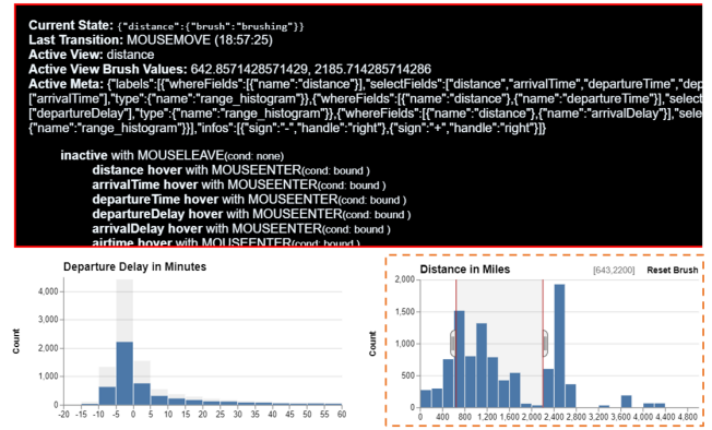
Figure 2: A snapshot of the dashboard obtained applying the Interaction-Driven Framework to a crossfilter interface. The user is currently brushing on the “Distance in Miles” histogram.

(ii) A user interaction is captured by the interaction layer and sent to the translation layer which extracts the SQL queries to be executed. This feature is implemented through the Label Module (LM) , which gives the result back by labeling the statechart. The generation of SQL prepared statement is implemented by the Query Module (QM) which manages a Query Storage (QS) , i.e. a data structure containing SQL Fragments. When the statechart is initialized, LM assigns a specific set of query parameters to each of its transitions that contribute to the SQL Statements. Those parameters are referred to as Query Metadata , organized in a set of query labels . When a transition leads to a state containing a Query Metadata, that information is acquired by QM : for each Query Label, a SQL Prepared Statement is created by taking from QS all the different fragments and filled with dimensional values and parameters.