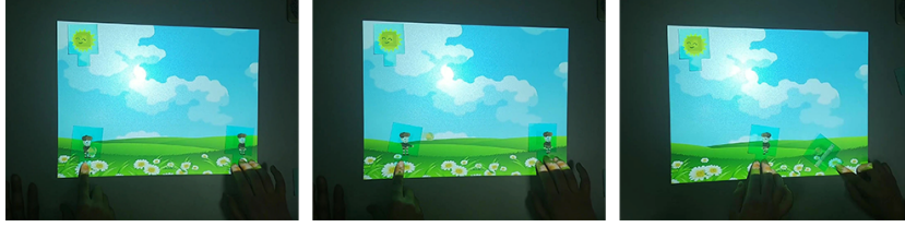
Fig. 3. Passing game