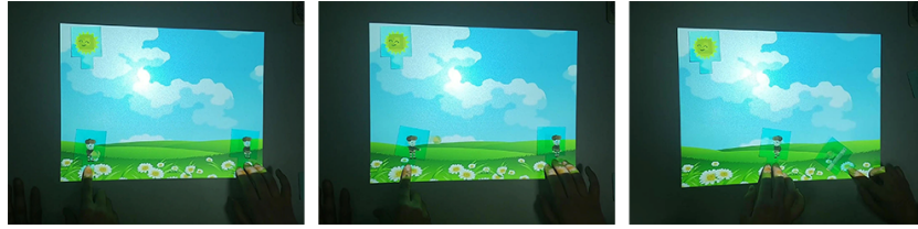
Fig. 3. Passing game