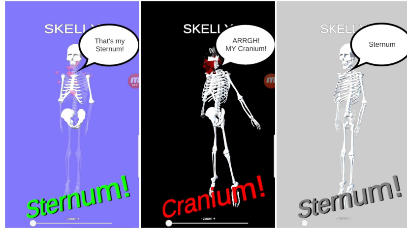
Fig. 1. Game play with 3 stimulus conditions: (from left to right) Non-violent, violent, neutral.

player. the three different game conditions all shared identical game mechanics. As the player taps a certain bone, Skelly will announce the name of the bone immediately in the form of the speech bubble and it will also be displayed in a comic style text. The game scene can be rotated around the skeleton, letting the player see each bone part in 3D. This allows players to associate with the visual representation of the bone parts, their spatial positions on the body and to learn the bone names through the gameplay. The game consists of two play modes. 1) Free Play Mode: the player can tap on any part of the skeleton to reveal the name of the part. 2) Challenge Mode: upon a prompt naming a certain bone, players have to find it and identify it by tapping on it correctly in order to move on to another part. Both modes have a time limit of three minutes.