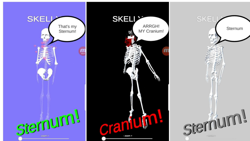
Fig. 1. Game play with 3 stimulus conditions: (from left to right) Non-violent, violent, neutral.

player. the three different game conditions all shared identical game mechanics. As the player taps a certain bone, Skelly will announce the name of the bone immediately in the form of the speech bubble and it will also be displayed in a comic style text. The game scene can be rotated around the skeleton, letting the player see each bone part in 3D. This allows players to associate with the visual representation of the bone parts, their spatial positions on the body and to learn the bone names through the gameplay. The game consists of two play modes. 1) Free Play Mode: the player can tap on any part of the skeleton to reveal the name of the part. 2) Challenge Mode: upon a prompt naming a certain bone, players have to find it and identify it by tapping on it correctly in order to move on to another part. Both modes have a time limit of three minutes.