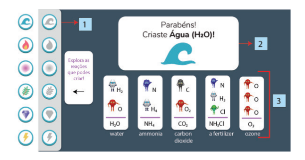
Fig. 3. 1. Icons reactions; 2. Congratulation messages; 3. Elements that participated in the reaction