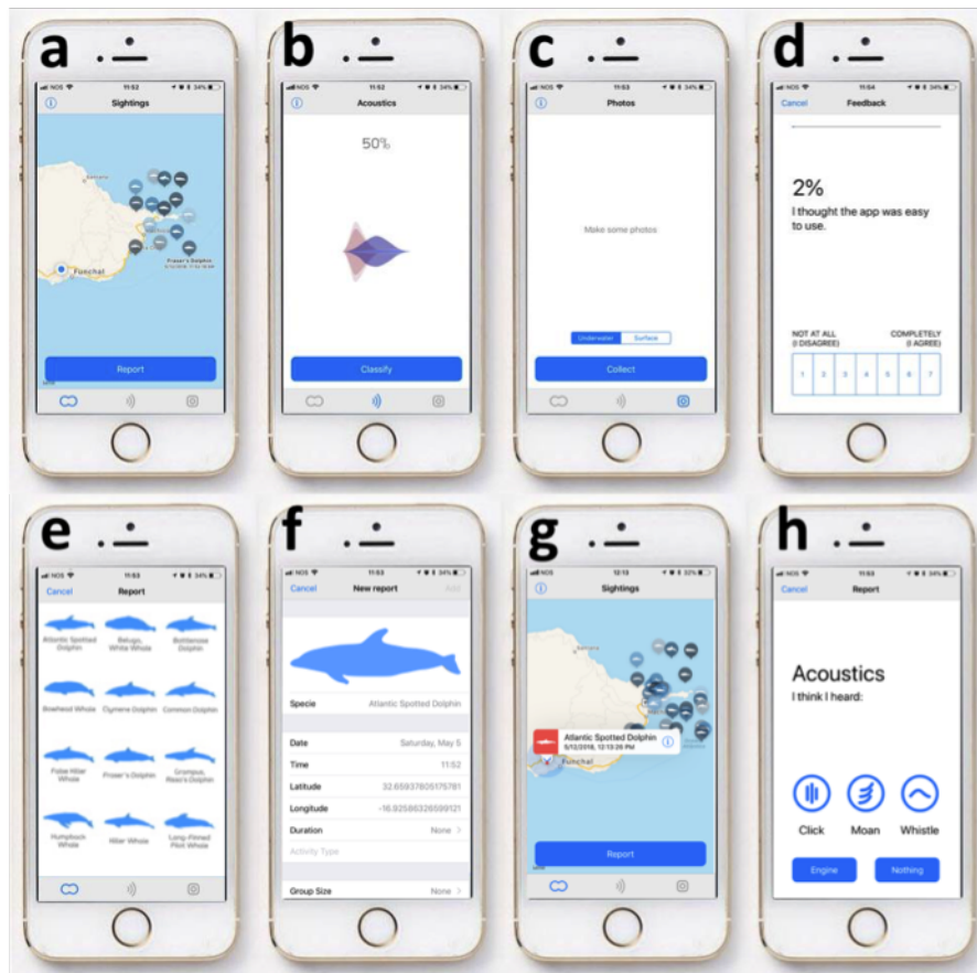
Fig. 2: Screenshots from the POSEIDON application. From left to right: (a) Sightings main screen, portraying the reported sightings; (b) Acoustics main screen, portraying the live acoustic feed from hydrophone; (c) Photos main screen, depicting collected underwater and surface photos; (d) Survey at the end of the experience; (e) Sighting report screen; (f) Sighting Reporting screen information collection; (g) Sighting reported at the GPS location. (h) Classification of acoustics with given options (click, moan, whistle, engine or nothing).