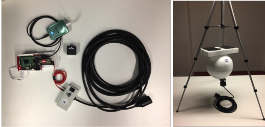
(a) Microcomputer with the power bank, Wi-Fi dongle (b) Assembled buoyant cap for communication with GoPro, audio jack and stereo cable, and a hydrophone. Tripod is used for exhibition.