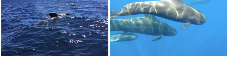
(a) Surface image of the pilot-whale sunbathing and taking a rest. (b) Underwater images of the two breastfeeding mothers with one calf.