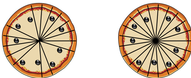
■ Figure 1 Two examples of pizzas where Bob can always get 5 of the 9 olives.

cut, and play so as to take all the even-numbered slices or all the odd, whichever is better for her. The argument fails if the number of slices is odd. But the odd case sounds even better for Alice since then she ends up with more slices. How can we get a handle on the odd case?