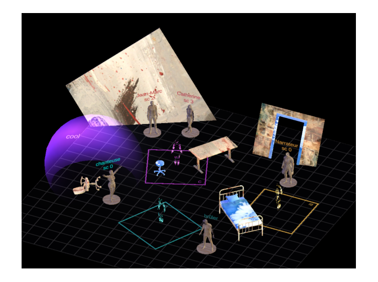
Figure 1: The virtual table

First, the creator works fully immersed in the virtual environment, reducing the cognitive load of decoding a 2D interface. He/she composes the space directly in the headset with its controllers in proprioceptive immersion, using low-level cognitive functions. By this way, it makes it possible to imagine the representation space while manipulating it with a top level viewpoint above the model. We thus combine the ego, hetero, object and allo-centric representation systems.