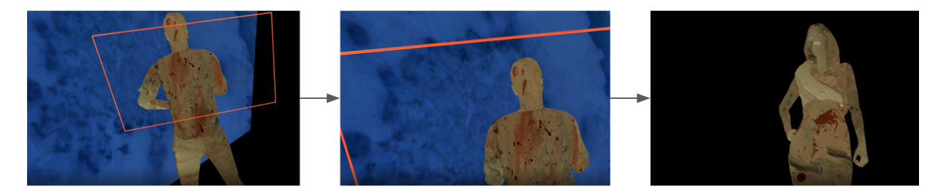
Figure 4 : Wormhole experienced in the narrative in first person view.