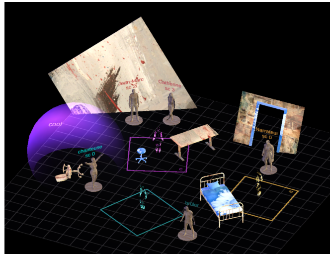
Figure 1: The virtual table

First, the creator works fully immersed in the virtual environment, reducing the cognitive load of decoding a 2D interface. He/she composes the space directly in the headset with its controllers in proprioceptive immersion, using low-level cognitive functions. By this way, it makes it possible to imagine the representation space while manipulating it with a top level viewpoint above the model. We thus combine the ego, hetero, object and allo-centric representation systems.