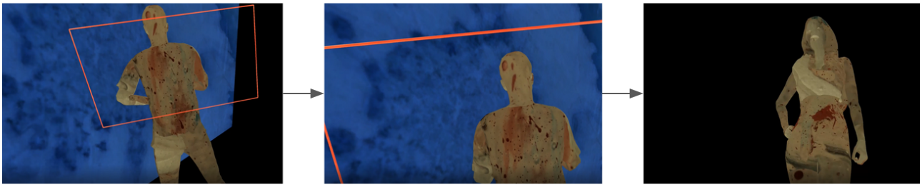
Figure 4 : Wormhole experienced in the narrative in first person view.