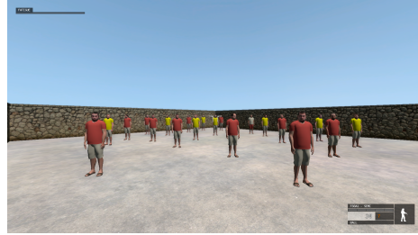
Fig. 2. An example 20-item set from the VBS3 (3D) environment. The target avatar is present on this trial.