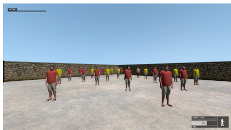
Fig. 2. An example 20-item set from the VBS3 (3D) environment. The target avatar is present on this trial.