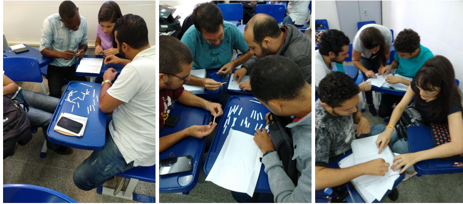
Fig. 3. “BDD Assemble!” game play by master degree students in a SE classroom.

As future work, it is intended to produce a digital version of the proposed game, as well as more BDD scenarios together with the application and evaluation of the game in different SE classes.