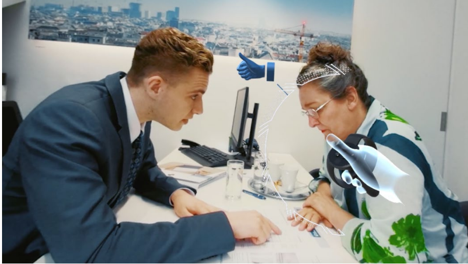
Figure 1. Insight the VR glass: Bank clerk attending client. User is feedbacking the action using a joystick