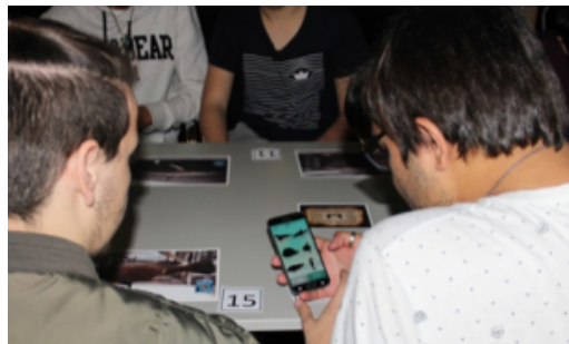
Fig. 5. Teenagers using the mobile app. to interact with the poster and capture the markers, during the usability test conducted in the lab.

Procedure. The users were split into two even groups (8 users per group) who performed the evaluation with the same protocol into two separates but equally sized and equipped rooms. In order to interact with the mobile app., we provided one smartphone shared by every two students. In preparation for the study we photographed and printed A4 sized posters of all the museum exhibits that are covered in the Haunted Encounters game (Fig. 5). These posters contained the picture of the exhibit photographed on the museum shelf and its associated marker on the side. The lab evaluation consisted in the students playing the game in pairs, as they were in the museum, finding the requested exhibit poster and capturing its corresponding marker in order to unlock the content and answer the quiz related to each exhibit. The posters were distributed on a table in the lab room. After the interaction with the mobile app, participants were required to compile two questionnaires one for the Multimedia Guide Scale and the other for the AttrakDiff.