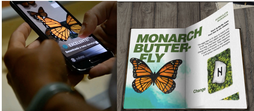
Fig. 4. Left side of the image: user interacting with the 3D model of the Butterfly displayed as Augmented Reality. Right side of the image: two pages of the digital book. It is possible to reload the 3D models of the animals by capturing the rune charms of the book pages.