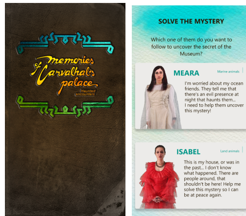
Fig. 1. The opening screen of the Memories of Carvalho’s Palace game (right side) and a screenshot of the two main characters that call the player for action (left side)

Here we present Memories of Carvalho’s Palace – Haunted Encounters (MoCP-HE) , a location-based game which involves players in uncovering factual and fictional elements of a museum premises and collection. We designed MoCP-HE as treasure hunt experience which makes use of AR in order to engage digital native teenagers in pursuing scientific knowledge about the museum exhibits. The goal of this project is to use gaming and narrative elements to influence our target group engagement with the museum content. The experience is currently being studied in order to understand teenage dynamics and preferences in museums providing a way to analyze the complex relationship between context of use, technological solutions, engagement and learning effectiveness. In the rest of this paper we first discuss related work, including museums related location-based games and stories. Then we describe the game mechanics and technological platforms used in Memories of Carvalho’s Palace: Haunted Encounters . Lastly, we report on some first preliminary user testing carried out with young gamers and users and provide some concluding remarks and indications for future work.