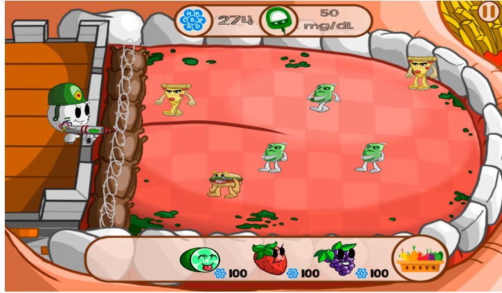
Fig. 2. Ultimate Food Defense game play scene.

To maintain a pleasant game, free use of fruits is not allowed during the game. To control it, the game has a coin (the vitamins), which are received after certain regular intervals of time or when an enemy is defeated. When the player does not have enough vitamins to buy fruits, they remains blocked.