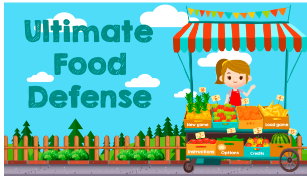
Fig. 1. Initial screen of the game.

The game main menu (Fig. 1) was designed as a child friendly representation of a sales stall containing healthy fruits to eat. For the menu buttons, five options are provided to the player: New Game , Load Game , Instructions , Options and Credits .