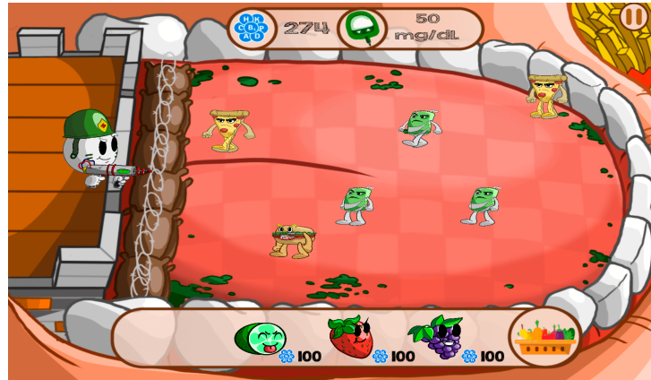
Fig. 2. Ultimate Food Defense game play scene.

To maintain a pleasant game, free use of fruits is not allowed during the game. To control it, the game has a coin (the vitamins), which are received after certain regular intervals of time or when an enemy is defeated. When the player does not have enough vitamins to buy fruits, they remains blocked.