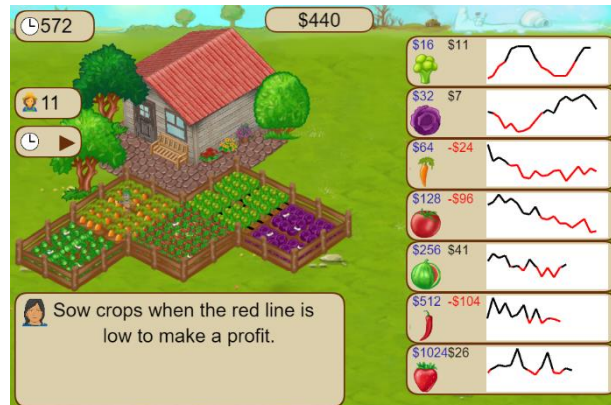
Fig. 3. The screen in Market Farmer showing all of the crop varieties available to the player by the end of the game and their price volatility.

The combination of increasing volatility and profitability with each crop and the advantages offered by the improvements affords players a number of different strategies for success when defined as the amount of money made at the end of the game. As players are limited to two improvements per field, choices must be made regarding the potential losses and gains provided by a combination of improvements, and the effect this has on mitigating the risk inherent in planting more volatile crops. Initially, there is a strong incentive for players to explore by experimenting with different combinations, and once a successful strategy has been established, players may then continue to exploit that strategy, or explore other strategies. However, players are not forced to choose between these approaches, and it is possible for players to pursue a given strategy in some fields while exploring alternatives in others, or to adopt a broad strategy within which there may be some room for exploration.