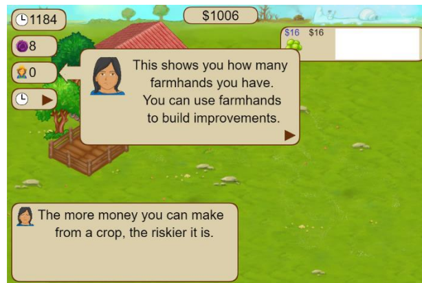
Fig. 1. A farmer explains how to access improvements in the Market Farmer tutorial.

game in the tutorial that follows. The farmers state the broad aim of the game in terms of maximising the amount of money made, and the player clicks through further screens with each farmer presenting aspects of gameplay from positive and negative perspectives: one stating a problem and the other offering a suggestion for solving it. For example, players are told that they can plant new crops and make improvements, but that some crops are expensive and risky. Players are then given an opportunity to sow and harvest a crop of potatoes, which provides very little profit, but is also very low risk. After this, the option to sow potatoes is removed and replaced with broccoli, thus signalling the beginning of the game. The player begins with $1000, and if this amount falls below $20, it is automatically topped up to $20, thus allowing the player to sow broccoli crops and continue playing the game. Features of the game such as floods and improvements are explained to the player as they appear in the game in a similar manner to the tutorial. Figure 1 shows a screenshot from the game with a farmer explaining how to access improvements.