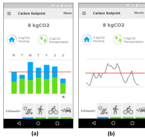
Fig 2 Smiling Earth - CO 2 emission data visualization

buttons" which are for solar panels, walking, cycling and an electrical vehicle, from left to right. By clicking on the "estimation buttons", the relevant values will be displayed. For example, in Fig 1 (c), the estimated CO 2 emission by selecting an electrical vehicle is shown as 0.0kg. On the other hand, the estimation for walking while either sometimes driving a combustion engine vehicle or using conventional heating means could lead to a higher CO 2 emission as shown in (d). These values are based on statistical data [11] and analyses conducted by SINTEF Energy and the DESENT partners.