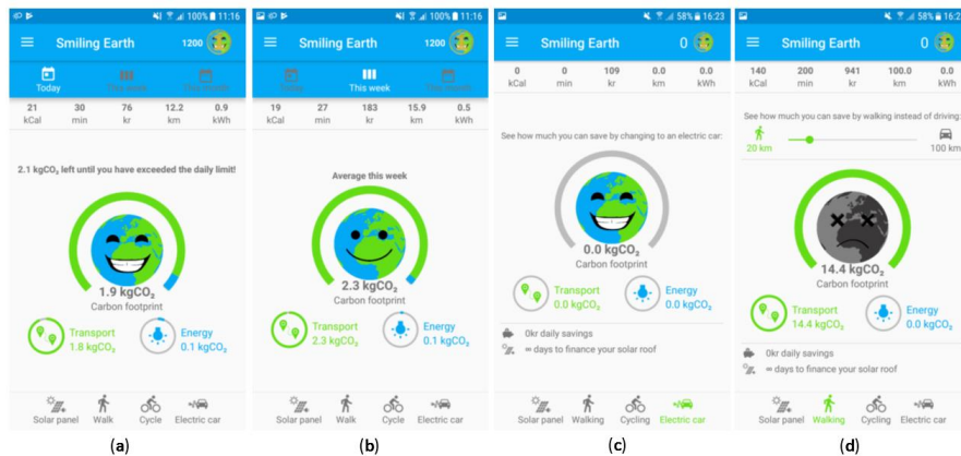
Fig 1 Smiling Earth concept and GUI

The central concepts that influence the design of Smiling Earth are CO 2 emissions, health benefits, environmental impact and economic profit. The Graphical User Interface (GUI) for the main page is designed to reflect these concepts and draw the user's attention to the concept of CO 2 emissions and how that affect the world we live in; see Fig 1. Metaphors have been used to create emotional attachments to concepts such as the environment; e.g. [8-10]. We have used the earth as a metaphor to show the impact of a high carbon footprint (global warming) which may be caused by the user's actions. The dashboard for the app, shown in Fig 1 (a) and (b), show the daily values of CO 2 emissions by an individual, from transportation and domestic heating. The circular indicator informs the user about the current value emissions in kg of CO 2 . The number indicated in the circle is the daily value. The circular progress bar for each circular indicator shows the user's value relative to the maximum allowed level of emissions; i.e. the target for the user must be less than this maximum amount. The daily goal for the CO 2 limit is 4 kg CO 2 for the carbon footprint.