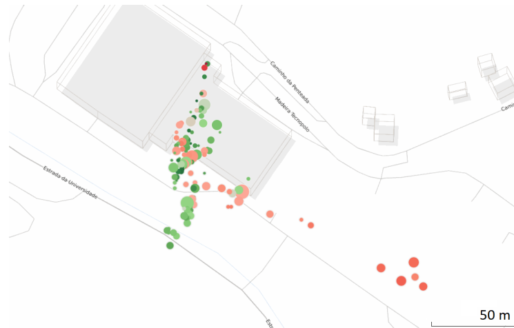
Fig. 2. Game Heatmap - logged events during the gameplay in indoor and outdoor settings. Line in bottom right corner indicates the scale ruler of 50 m. Color range (green to red) represents the signal strength (in RSSI). Circle size represents the number of events occurred in that location.

Gameplay Analysis and Strategies. Using the storage on microcontrollers, we gathered the event logs from the played games, counting the numbers of reset parameters, shoot trials, shots, successful shots, received hits and shake counters. From the device logs, Figure 2 depicts the location of the events using the GPS, where the color range represents the signal strength (in RSSI) and the circle size represents the number of events occurred in that location. It is worth mentioning that some of the marks are located inside of the building, where GPS accuracy may not be precise. Also some of the other points should be accounted as potential errors due to the game participants being located near the walls of the building, which may interfere with the GPS reception. Among all game players, only one participant decided to explore the distance (red circles at the lower right), and unlike the others, went even further away. Some participants managed to receive and send consecutive shots, while nearby buildings did not interfere much with the signal, nevertheless having the RSSI clearly weaker. Players varied their their speeds in some game plays, while in other, players were more passively walking, focusing in charging and shooting, and trying to hide and to obtain a greater distance from each other. Most relevant parameters registered were: 1) play time (min) (AVG 2:34, STD 1:18); 2) RSSI (-64.14 , SD 22.49); message time on air (ms) (AVG 36.02, SD 6.24);