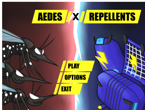
Fig. 1. Initial menu of the “Aedes vs. Repellents” game.

The general objective of the proposed game is to avoid the player house invasion by mosquitoes (Fig. 1). In this sense, as a protection strategy, the player must build defense towers, in this case repellents, able to avoid mosquitoes but with an energy consumption each one.