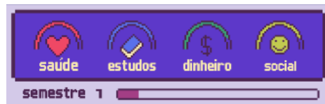
Fig. 1. HUD displaying the current player status.

Designed to be a mobile game that could be played with only one hand, the University Universe game dynamic is to balance the essential attributes of a university student: health, money, social life and grades (Fig. 1). These attributes are modified by the execution of campus activities according to the game map (Home, Library, Cafeteria and Academic Research Facility) (Fig. 2), which must be kept at a certain minimum value to continue playing. Each level represents a semester and the difficulty increases as the semesters advance, simulating what students face in a real course.