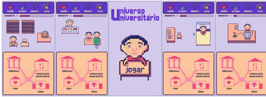
Fig. 3. General overview of the game scenes.

At the beginning of the game, the player has all attribute values maxed out (100 points). The player character starts at Home (Fig. 3), and, when the scene is touched, attributes are increased or decreased according to the context defined for the respective campus activity: