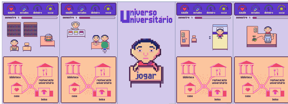
Fig. 3. General overview of the game scenes.

At the beginning of the game, the player has all attribute values maxed out (100 points). The player character starts at Home (Fig. 3), and, when the scene is touched, attributes are increased or decreased according to the context defined for the respective campus activity: