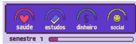
Fig. 1. HUD displaying the current player status.

Designed to be a mobile game that could be played with only one hand, the University Universe game dynamic is to balance the essential attributes of a university student: health, money, social life and grades (Fig. 1). These attributes are modified by the execution of campus activities according to the game map (Home, Library, Cafeteria and Academic Research Facility) (Fig. 2), which must be kept at a certain minimum value to continue playing. Each level represents a semester and the difficulty increases as the semesters advance, simulating what students face in a real course.