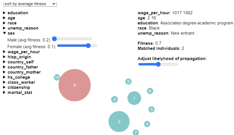
Fig. 2. A screenshot of our application illustrating the use case.

The end user of the profiling system is a marketing expert we will call John. Starting the GA, it immediately shows ten blue circles of varying sizes. Each circle is also labeled with a sequential number to ease identification. John hovers over one of the circles with his mouse, and he is presented with information about the profile that that circle represents, like its attributes, its fitness and the size of its target class (i.e., the number of people it targets). John is curious about some of the smaller circles, so he scrolls his mouse wheel and drags the canvas to pan and zoom in on his areas of interest.