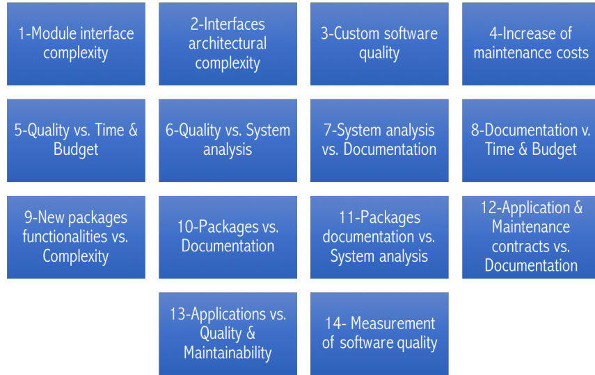
Fig. 2. Software Quality Concerns

the technical one has already been explored and led to the development of the SQALE method [12]. Indeed, SQALE identifies several technical sub-dimension and their related software metrics. However, we did not find in the scientific literature any similar framework addressing the social dimension. Therefore, we proposed a comprehensive managerial model. We pursued a theoretical mapping of the items within their related sub-dimensions. The outcome of the theoretical mapping for both technical and social dimensions is listed in Table 1.