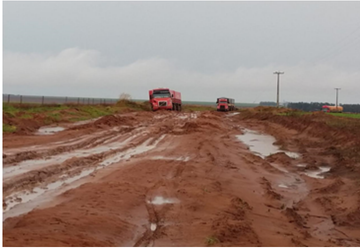
Fig. 4: Piauí Roadways

data collected in our study are in line with the national average. In addition, incentives such as the acquisition value of properties in Piauí states being less costly compared to land prices in other regions of savannahs in the country affects this soybean movement.