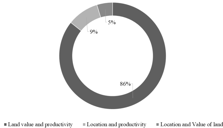
Fig. 2: Benefits of Soybean Production in Piauí

Most parts of the growers are migrants from the south of the country that bring the culture and knowledge of soybean production. The main reason to produce in Piauí according to the survey is the cost of land acquisition and productivity (86%), Figure 3. This result confirm the advance of agriculture production in the state [10].