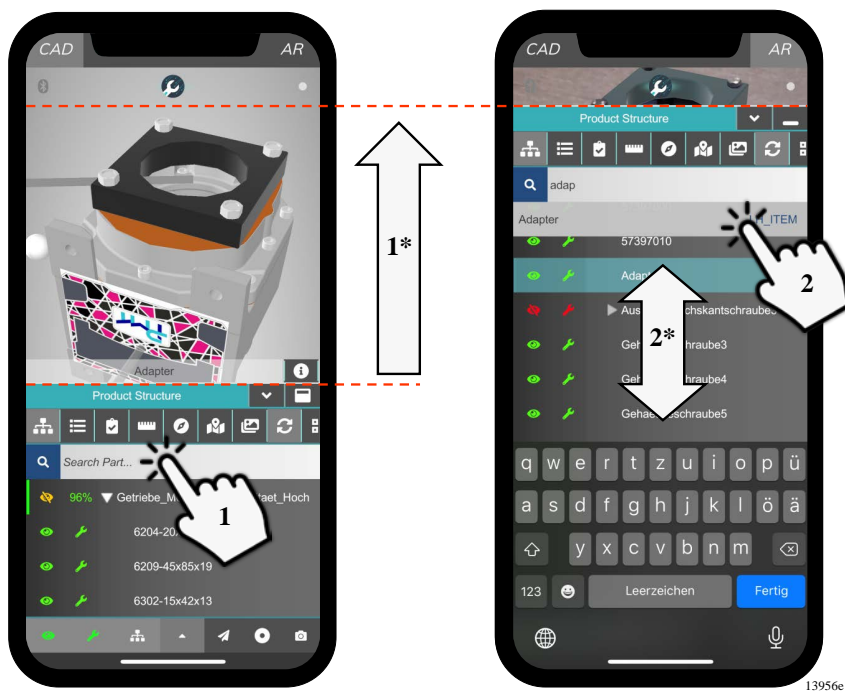
Fig. 3. Optimized user interactions with lists (1, 2) by automatic UI reactions (1*, 2*)

Improving Interaction with Lists. Lists will automatically react to changing selection in the 3D area by expanding items and scrolling to the relevant list entry (auto-scroll) as shown in Figure 3. When using the search bar on top of a list (1), the 2D area is automatically expanded to full screen (1*). Selecting a search result (2) also leads to the aforementioned auto-scroll behavior (2*).