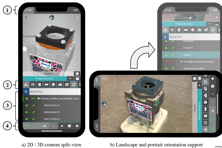
Fig. 2. UI of the smartphone-based IAR prototype

Additionally both 2D content areas of the tablet UI can be combined into a single one to substantially reduce the need for screen space (3). Since most modules are designed to be used independently, the 2D content area can be restricted to only contain one module at a time. Lastly the bottom control bar is resized to fit larger buttons, which demand for less typing precision (4).