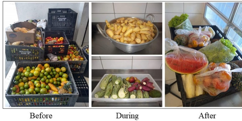
Fig. 2: Capillarity Project.

cer, HIV) and other entities that are not registered by CMAS. Once routed, these families are registered in the project and become benefited from food baskets.