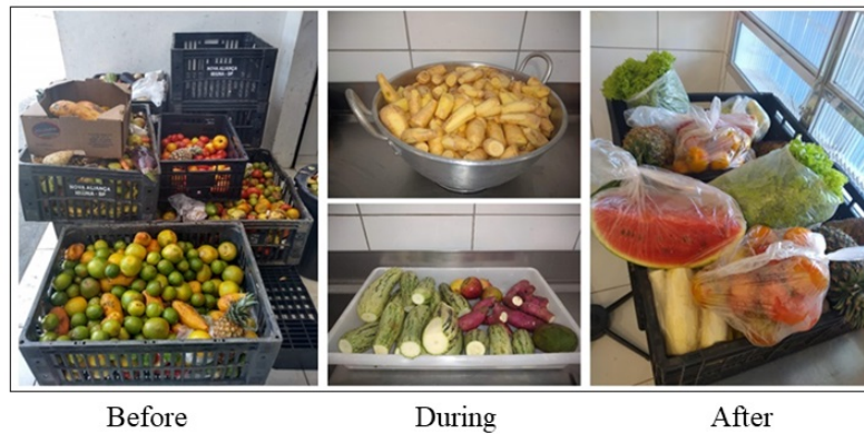
Fig. 2: Capillarity Project.

cer, HIV) and other entities that are not registered by CMAS. Once routed, these families are registered in the project and become benefited from food baskets.