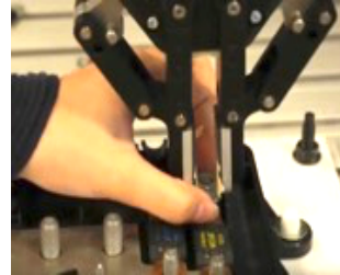
Figure 1.3: Collaboration work