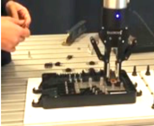
Figure 1.1: Synchronized Work