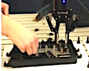
Figure 1.2: Cooperation work