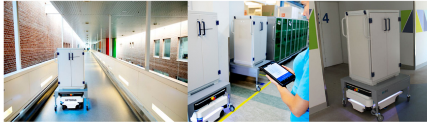
Fig. 1. AMR in sterile instrument logistics [10]

There are 10 pick and delivery stations located among five different levels in the case hospital. The AMR can open doors, use elevators, enter departments, bypass obstacles, handle dynamic environments, and reach the destination pickup-and-delivery station to deliver the sterile instruments. The AMR delivers approximately 60 wagons daily and substitutes one full-time employee.