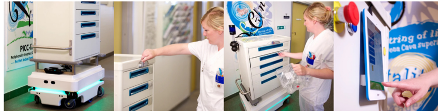
Fig. 2. Sending and delivery of cancer medicine with secured transportation [10]

The case hospital uses an AMR to transport the medicine in a locked drawer from the basement through the hospital to the final destination in the department [10]. After delivery, the AMR returns to the pharmaceutical department and waits to receive the next order. The AMR reduces the healthcare personnel's responsibility and the amount of time involved in the transportation of medicine. This helps healthcare personnel increase patient care and value-added time and thus has enabled the return of the initial investment within one year.