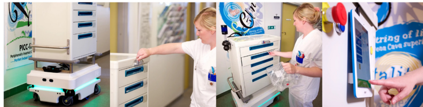
Fig. 2. Sending and delivery of cancer medicine with secured transportation [10]

The case hospital uses an AMR to transport the medicine in a locked drawer from the basement through the hospital to the final destination in the department [10]. After delivery, the AMR returns to the pharmaceutical department and waits to receive the next order. The AMR reduces the healthcare personnel's responsibility and the amount of time involved in the transportation of medicine. This helps healthcare personnel increase patient care and value-added time and thus has enabled the return of the initial investment within one year.