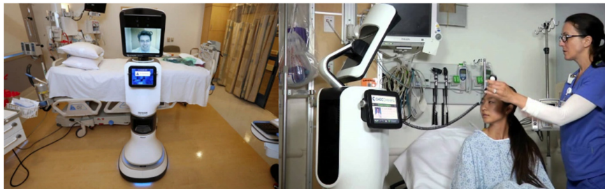
Fig. 3. AMR providing telemedicine [12]

AMRs with teleoperating and medical equipment can be controlled by a human from a long distance and perform tasks in dynamic environments [11]. Tele-operation enables a new method of using this valuable resource and eases the high risk of infectious disease transfer. Physicians and specialists can communicate with patients and perform some of their duties at a safe distance from infected patients. A telemedicine robot with autonomous navigation technology has been introduced in hospitals in the US [12]. While the AMR moves from room to room, the physician can easily connect for patient consults and access clinical documentation, patient data, and medical imaging. Digitizing and robotizing the material handling activities will provide data for and insights into new options for process improvement.