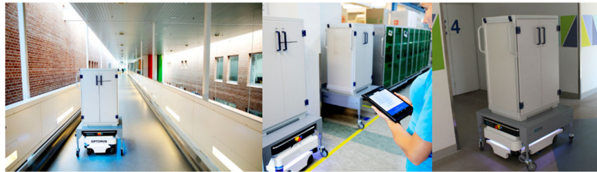
Fig. 1. AMR in sterile instrument logistics [10]

There are 10 pick and delivery stations located among five different levels in the case hospital. The AMR can open doors, use elevators, enter departments, bypass obstacles, handle dynamic environments, and reach the destination pickup-and-delivery station to deliver the sterile instruments. The AMR delivers approximately 60 wagons daily and substitutes one full-time employee.