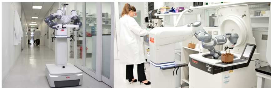
Fig. 4. Assistive, collaborative AMR in a hospital laboratory [14]

AMRs with manipulators can assist workers by interacting with humans as robotic coworkers. In other industries, AMRs are used as assistive systems and can mount several heavy parts of a car body together at different stages along the car assembly line [13], thus increasing both productivity and quality while simultaneously reducing fatigue levels among workers. A dual-arm mobile robot has been introduced to a US hospital laboratory [14]. The AMR was designed to work alongside medical staff and help complete lab workers' repetitive tasks (Fig. 4).