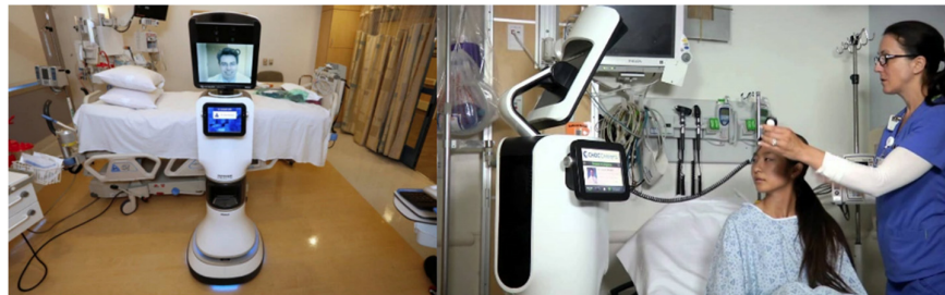
Fig. 3. AMR providing telemedicine [12]

AMRs with teleoperating and medical equipment can be controlled by a human from a long distance and perform tasks in dynamic environments [11]. Tele-operation enables a new method of using this valuable resource and eases the high risk of infectious disease transfer. Physicians and specialists can communicate with patients and perform some of their duties at a safe distance from infected patients. A telemedicine robot with autonomous navigation technology has been introduced in hospitals in the US [12]. While the AMR moves from room to room, the physician can easily connect for patient consults and access clinical documentation, patient data, and medical imaging. Digitizing and robotizing the material handling activities will provide data for and insights into new options for process improvement.