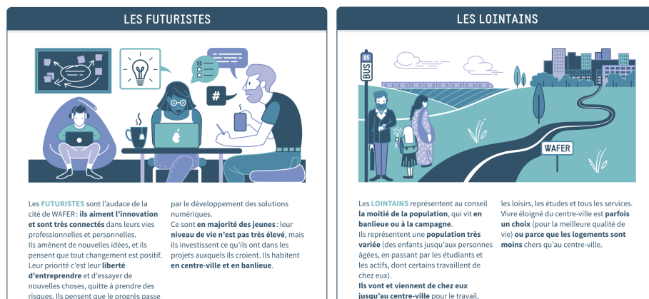
Figure 2. Extract of game cards describing two of the roles. Illustration © Marie Jamon

As shown above, the different solutions all have pros and cons, and will be more or less acceptable to different user groups. In our debate game, participants do not play in their own name, but will assume a role as member of a specific group of citizens. The idea of having users play a role other than themselves is not new and is proven to favour perspective-taking (Jarvis et al. 2002; Resnick and Wilensky 1998). We also wanted participants to take distance from their character to keep the debate more peaceful, all the more on a very sensitive topic while the COVID-19 epidemic is still not over.