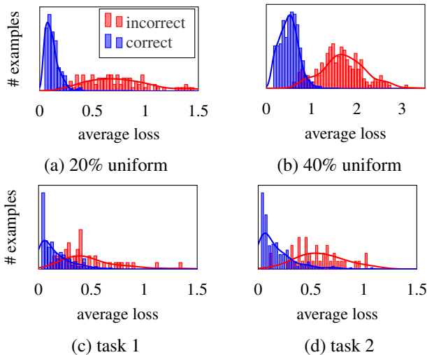
Figure 2. (a,b) Distributions of loss values (12) for correctly and incorrectly labeled examples, normalized independently. Uniform label noise: (a) 20%, (b) 40%. Pseudo-labels predicted by (11) for two different 1-shot transductive miniImageNet tasks (c,d).

Tasks We consider N -way, K -shot classification tasks with N = 5 randomly sampled novel classes and K \in \{1, 5\} randomly selected examples per class for support set S , that is, L = 5K examples in total. For the query set Q , we