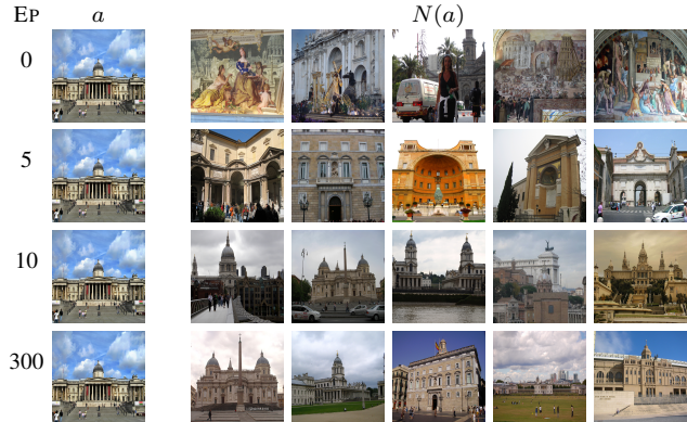
Figure 2. Asymmetric hard negative mining . One anchor a shown on the first column, followed by the hard negatives N(a) mined for this anchor, over different epochs. The anchor is represented by the student and the database of potential negatives by the teacher.

Complexity and parameters Table 1 gives the number of parameters and computational complexity (in FLOPS) for