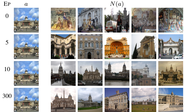
Figure 2. Asymmetric hard negative mining . One anchor a shown on the first column, followed by the hard negatives N(a) mined for this anchor, over different epochs. The anchor is represented by the student and the database of potential negatives by the teacher.

Complexity and parameters Table 1 gives the number of parameters and computational complexity (in FLOPS) for