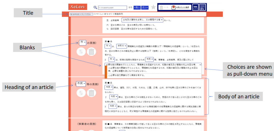
Fig. 3. GUI of a template in the extended version of the eLen

Response to the Issue (2) and (3). The eLen was developed based on the needs of officials in local governments, which were that of making laborious work on searching and gathering ordinances among different municipalities more efficient, and that of making time-consuming jobs on creating comparison tables among referring ordinances more easily. There was no tool by which enabled drafters to search ordinances among different municipalities and to create comparison tables easily before the eLen was released to every municipality in Japan. Drafters used to do the task by looking for other municipal websites one by one, and to create a table by copying and pasting parts of ordinance texts.