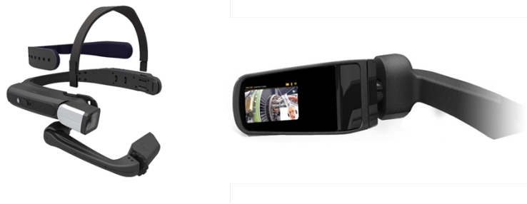
Fig. 1. A visualisation of the Head-Mounted Tablet 1 (right) and an illustration of the arm with the information given (left)

their hands to be free for tasks. It has been developed for industrial use, which is why the 380g device can be combined with a safety helmet and safety goggles. This weight includes a 3250mAh battery with an 8-hour charge life. Active noise suppression of up to 90dB is designed to ensure reliable speech recognition even in noisy environments. Furthermore, the HMT-1 is waterproof, shockproof, dustproof, and can be used in temperatures from -20C to 50C. The colour microdisplay with a resolution of 854x480 pixels can be worn over the left or right eye (realwear.com). A unique feature of this technology is that the cognitive support (i.e., the information that is displayed) can be physically retrieved or folded away. Thus, the user has good control over the display technology in his or her field of view, and can fold it away before becoming distracted or annoyed by the displayed information.